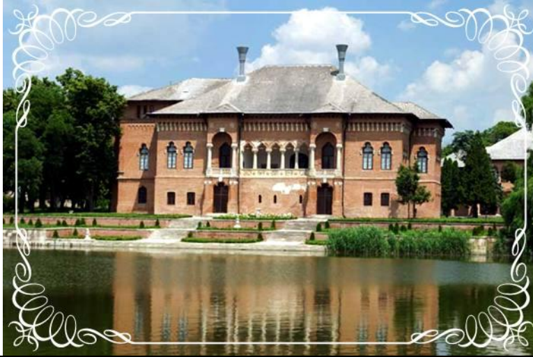
Snagov Lake and Snagov Monastery