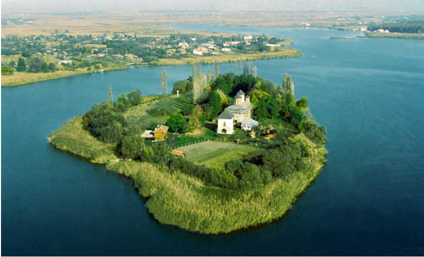
Snagov natural reservation (flora/fauna)